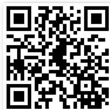
Ready Global Academy